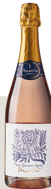
Rosato Spumante Spumante Metodo Charmat Romagna DOC Spumante Rosato 750 ml