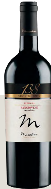
138 Romagna DOC Sangiovese Superiore 750 ml