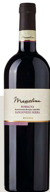
Masselina Riserva Romagna DOC Sangiovese Riserva MGA Serra 750 ml