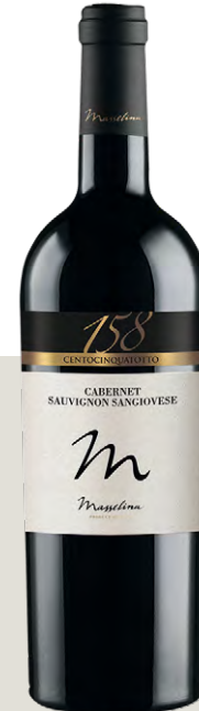
158 Rubicone IGT Cabernet Sauvignon Sangiovese 750 ml