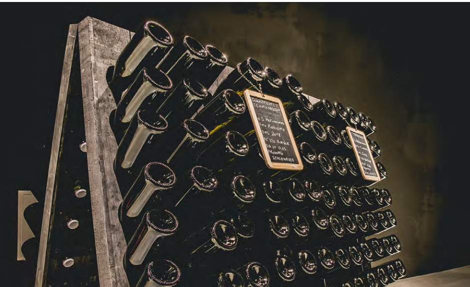
The ageing cellar for our Vintage "Metodo Classico" Sparkling Wine