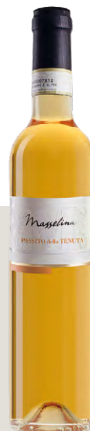
Passito della Tenuta Romagna Albana DOCG Passito 500 ml