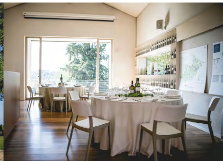
Wine & food tasting room