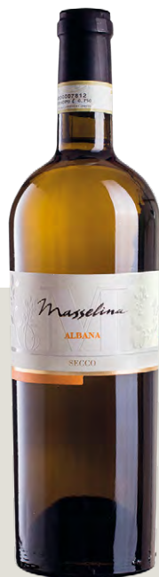
Masselina Albana Romagna Albana DOCG Secco 750 ml