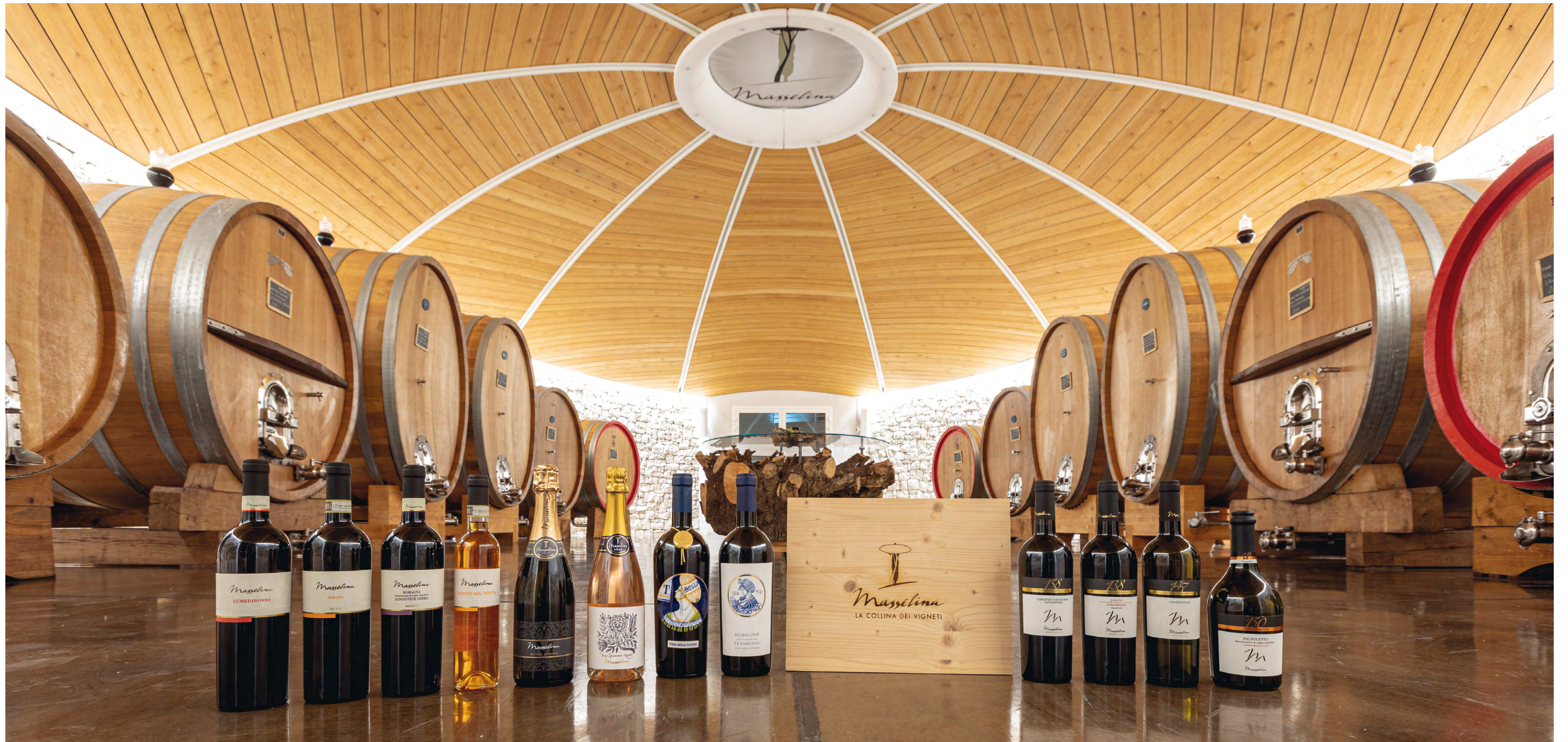
The barrel cellar at Tenuta Masselina