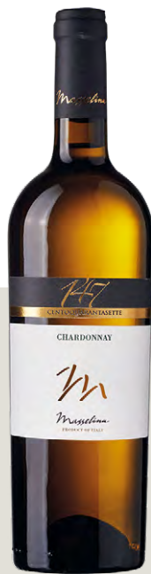
147 Rubicone IGT Chardonnay 750 ml