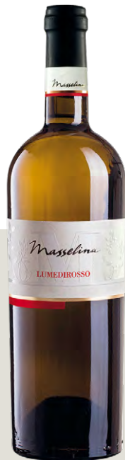
Lumediroso Cabernet Sauvignon vinificato in bianco Rubicone IGT Bianco 750 ml