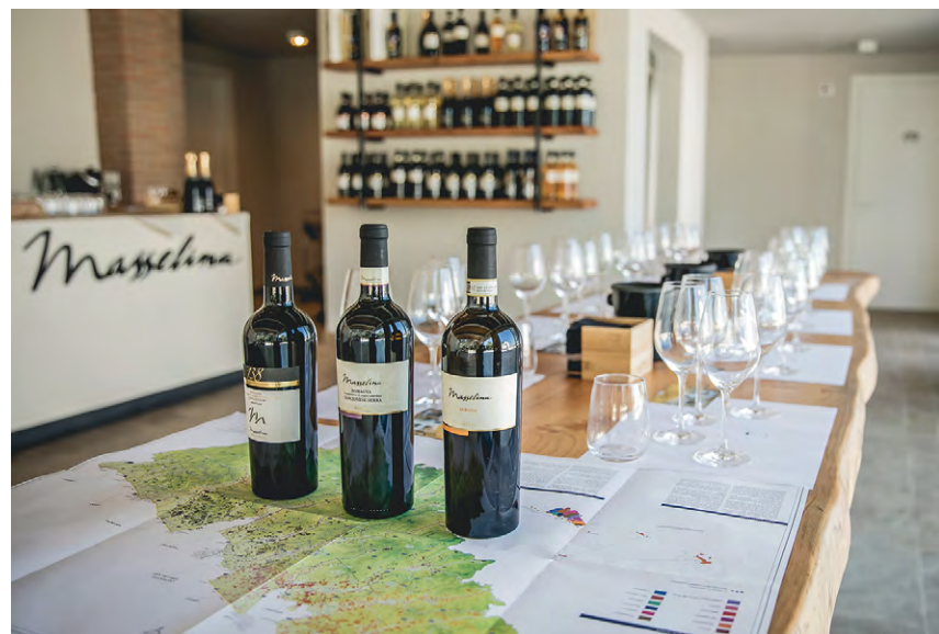
Sala fienile, il negozio

To this cultivar we have devoted a vineyard of vines trained on the typical small local pergolas, a project of VINIFICATION IN AMPHORAS and, naturally, traditional vinification in the dry and sweet 'passito' styles included in the Romagna D.O.C.G..