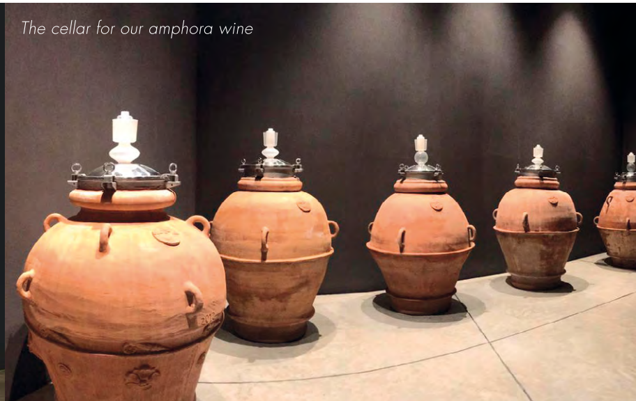
The cellar for our amphora wine