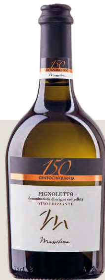
150 Pignoletto DOC frizzante 750 ml